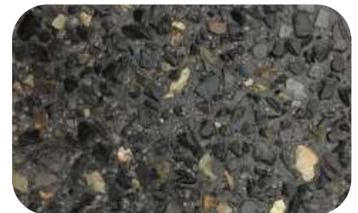
AMAZON 28 BLAK

PLEASE NOTE: The images above are indicative only and are presented as a guide. Do not base your selection solely on this document. Visit our showroom to see actual concrete samples before making your final decisions.