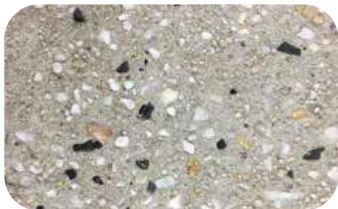
BLIZZARD ICE 91 HALF WHITE