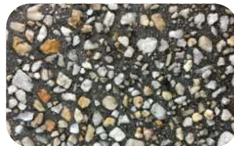
MIRAMAR ICE 55 BLACK