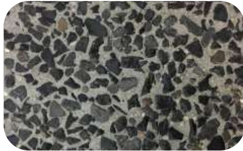
BROAD PEAK ASH