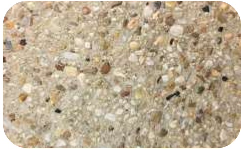
CHEYENNE 46 IVORY