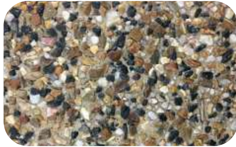
BALTIC DELTA 82 IVORY