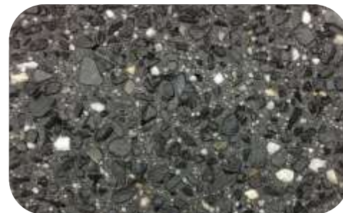
PALERMO ICE 19 BLUESTONE