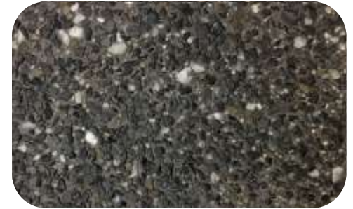
RIO NEGRO ICE 28 BLACK