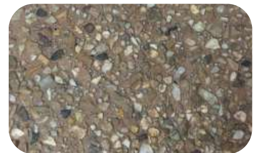
AMBER ASH HALF TUSCANY